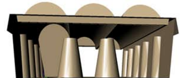
Internal lid Support